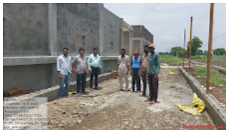
RA-II Photo 1.jpeg 165K