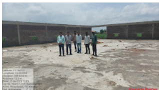
RA-II Photo 2.jpeg 146K