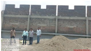
Ra-II Photo 3.jpeg 166K