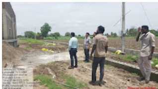
RA-II Photo 5.jpeg 177K