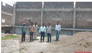
RA-II Photo 4.jpeg 193K